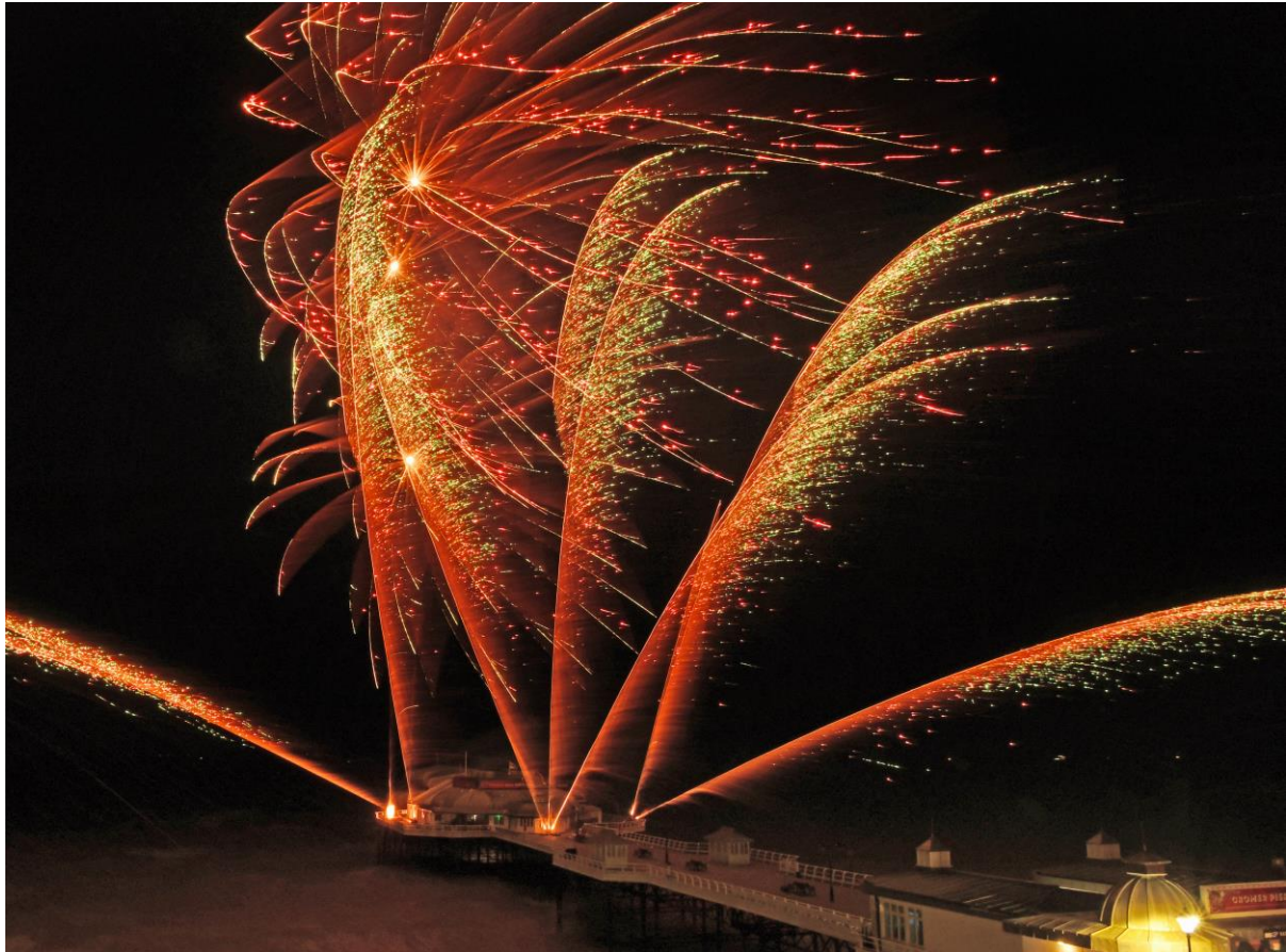
Cromer New Year's Day Fireworks 2019. R Birnie

All eyes will be on the skies above Cromer Pier on 1 st January 2020 as the traditional New Year's Day Firework display celebrates its 21 st anniversary.